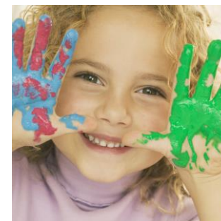
Arts & Crafts